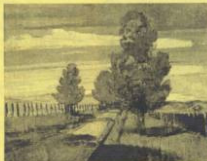
"Pines Aldinga" (on loan to N.S.W. Art Gallery)

STARS takes great pleasure in inviting you to the launch of the book