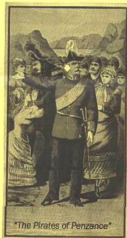
"The Pirates of Penzance"